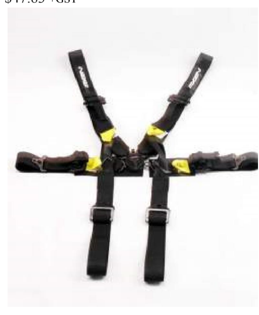
HARNESS NZKW SFI Arm Restraints for Speedway racing $47.83 +GST