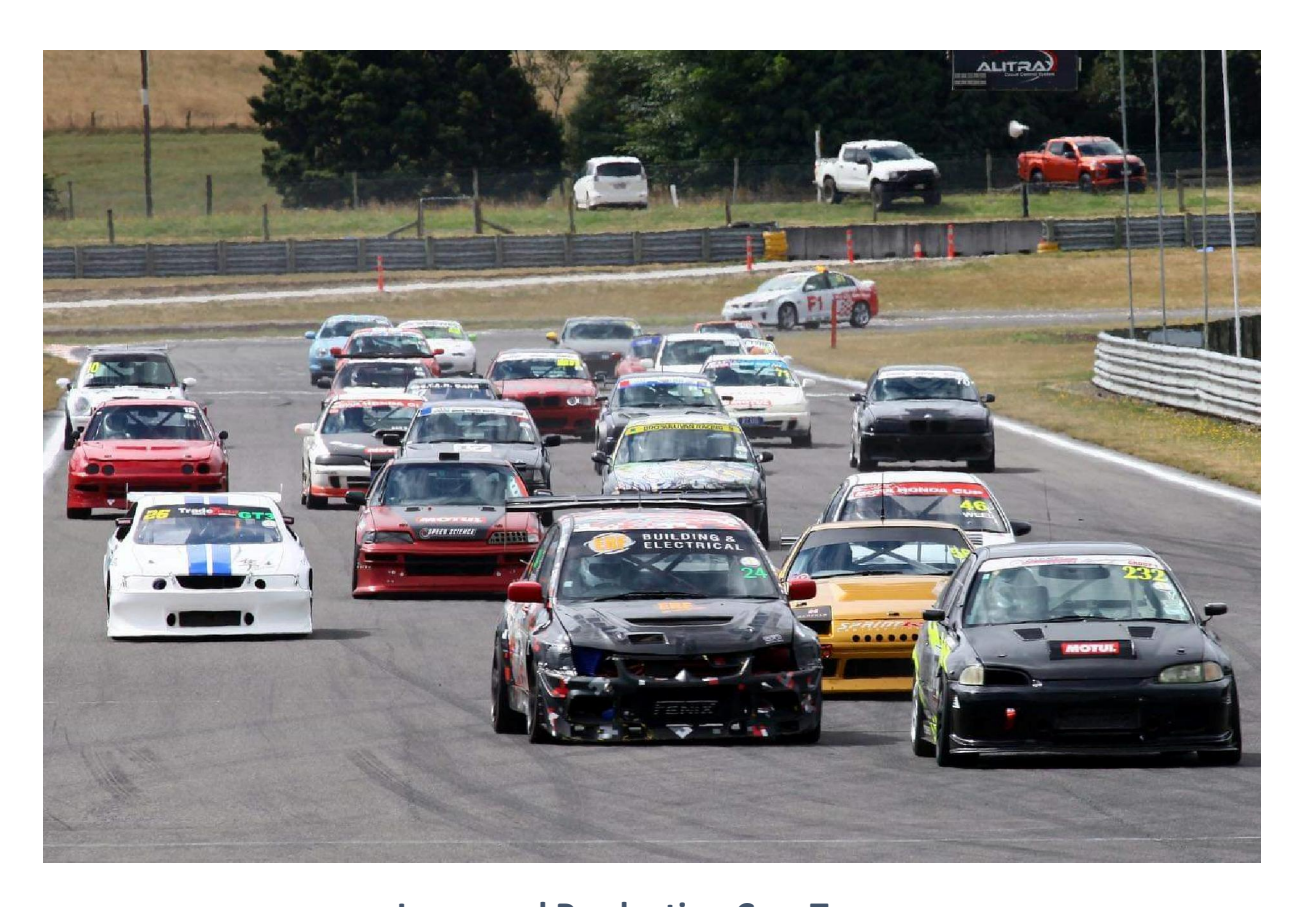
Improved Production Cars Taupo

Facebook HRCEventsNZ Facebook New Zealand Racing Drivers League