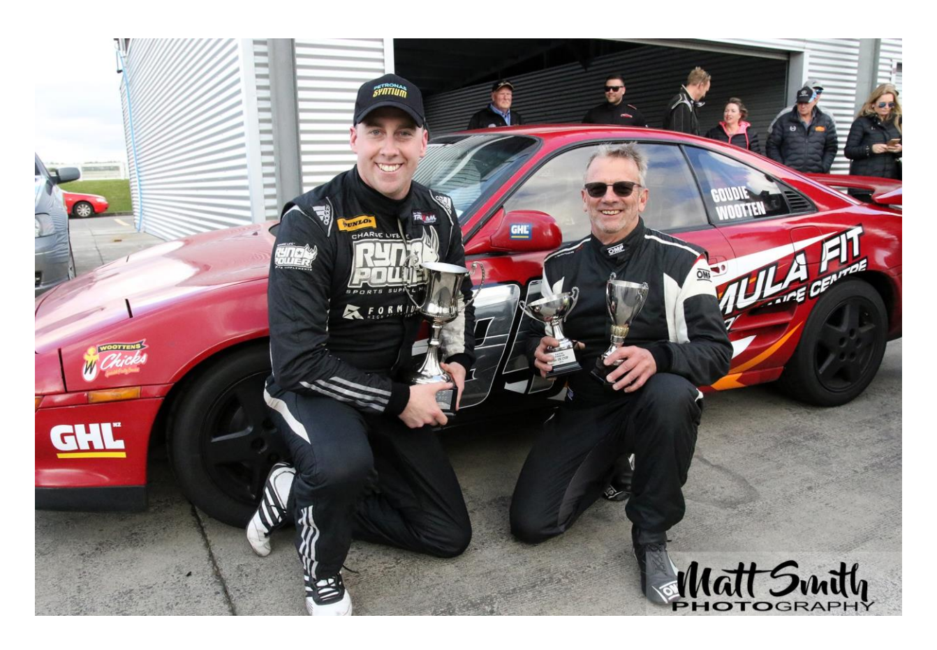
2019 B&H500 Winners